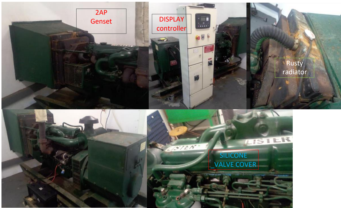
Fig 2: Photos - 2AP 3P 100 kVA Generator